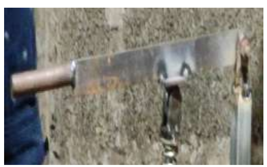
Fig 2.3. Lever