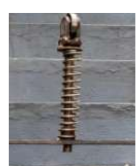
Fig 2.1. Cutting tool

It contains a sharp circular end, which will comes in contact with sap of the nutmeg. Thus it will remove the sap and also push the nutmeg through the cutting blades.