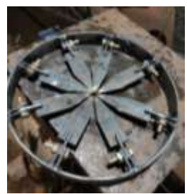
Fig 2.2. Cutting blades

It have soft edges so as it comes in contact with the nutmeg it will detach the mace safely along by the pushing force. Here there are eight cutting blades and are arranged in a circular shape so the space at the centre is correct fit for the nutmeg.