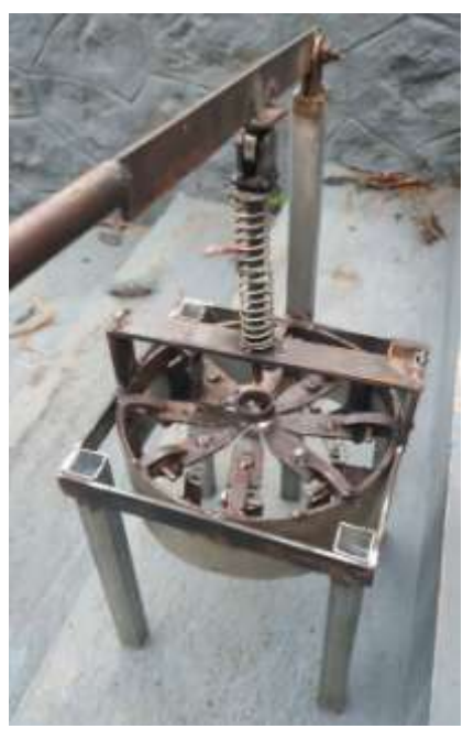
Fig 3.2. Fabricated Model